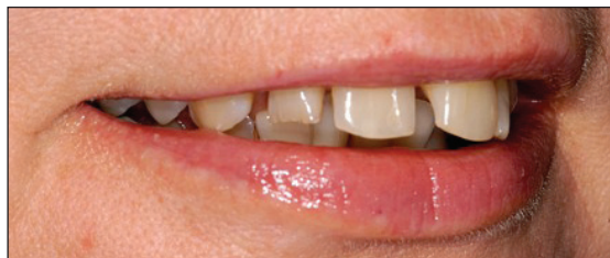
Pre-operative smile of proclined and discoloured teeth with multiple diastema

Transitional restorations testing space closure and change in bucco-lingual inclination of anterior teeth.