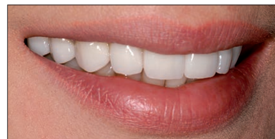
Post-operative view of the perfect smile