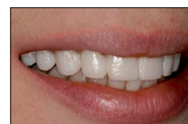
Transitional Luxatemp restorations after artistic contouring