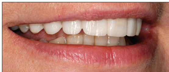
Transitional Luxatemp restorations after artistic contouring

It is within this framework that the entire smile is developed. The best place to determine these variables is within the patient's mouth. The dentist's knowledge of smile design and the patient's guidance through functional movements and speech will dictate the final position and appearance of the incisors.