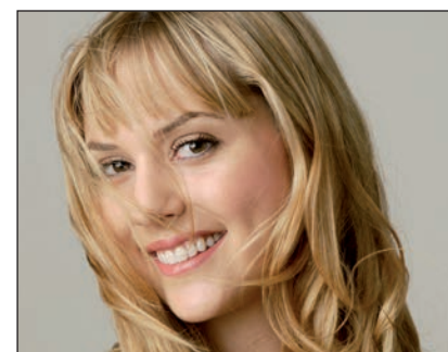
Before and after photograph of the patient with her new smile