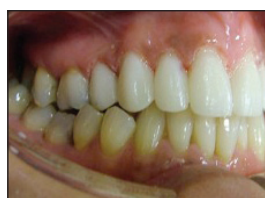
Transitional Luxatemp restorations after artistic contouring