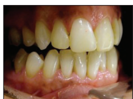
Pre-operative retracted view of the teeth

Transitional restorations showing change in perceived Golden Proportion and width/length ratio of teeth by changing the position of the reflective line angles.