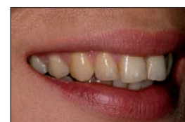
Pre operative view of the patients smile

The perfect smile through exceptional provisional restorations: