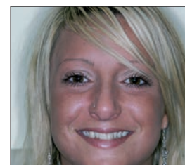
Pre-operative smile showing moderate anterior crowding

Temporisation is an integral part of comprehensive treatment involving smile design concepts. It represents the treatment phase that allows a dentist to be an artist. Temporary fabrication also provides proper communication for the laboratory, which directly affects the case. Eliminating as much of the guesswork as possible helps create a predictable result, and a happy smiling patient.