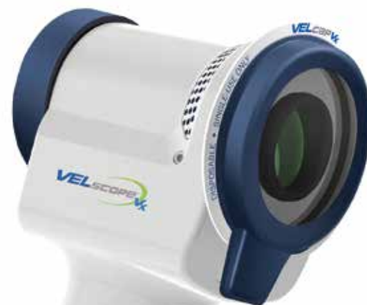
The VELscope VX a specialist device that allows us to identify oral disease

At The Perfect Smile Studios we want to offer you the chance of early detection and diagnosis of oral pathology (anything abnormal in your mouth). We use the latest oral cancer screening technology to facilitate our diagnosis.